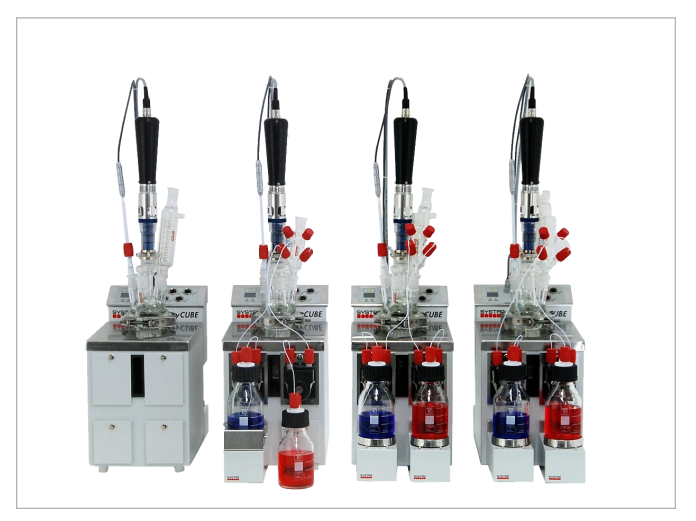
FlexyCUBE - Parallel Synthesis Workstation

FlexyConcept from SYSTAG provides a uniquely integrated solution with all data available across the process and able to be displayed at the click of a mouse in a single chart, whether from milliliter or kilogram scale.