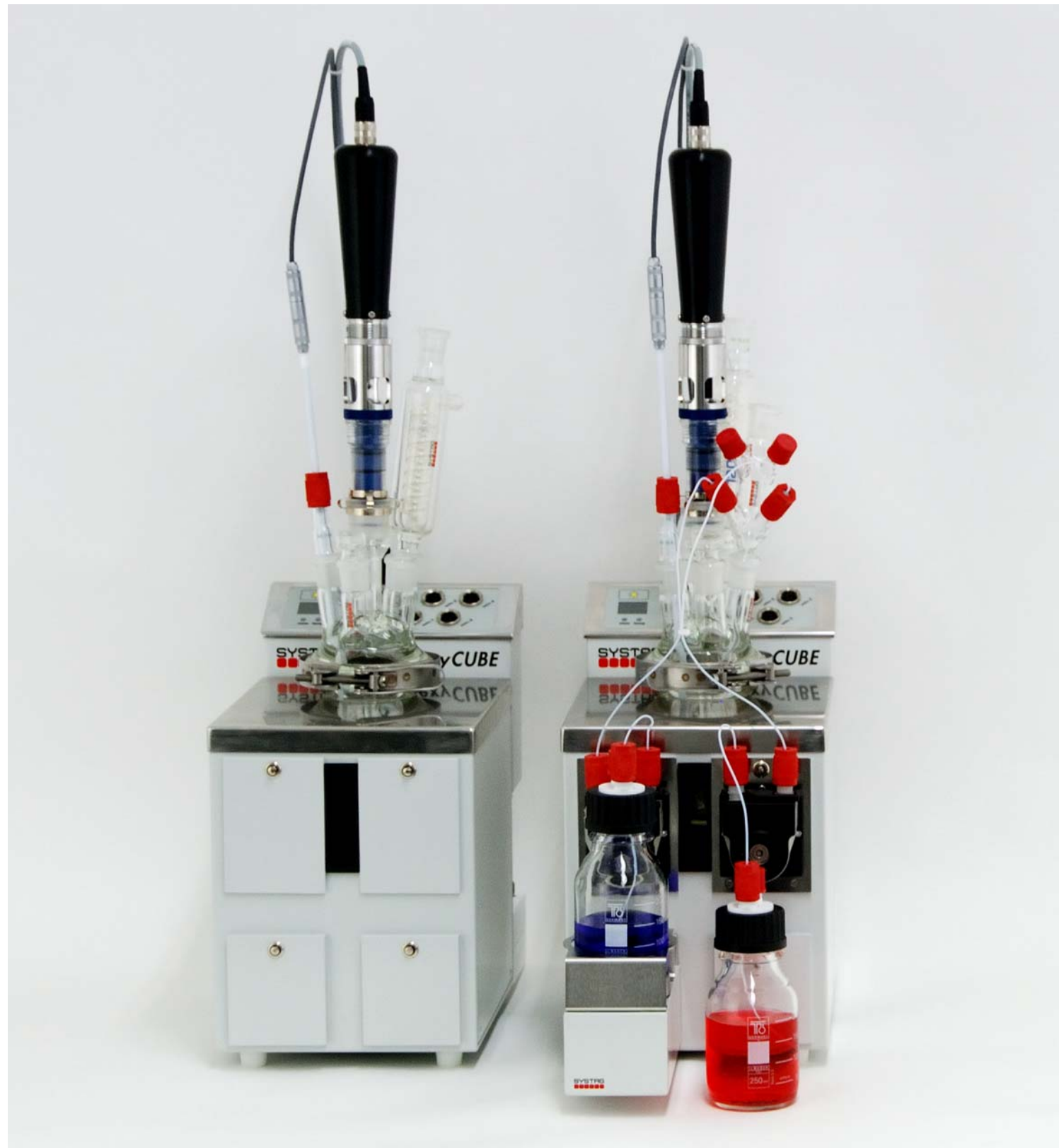
This combination of two FlexyCUBE units shows one FlexyCUBE without dosage equipment (left, also ideally suited for pressurised reactors), and one more unit on the right, equipped with gravimetric (left half) and volumetric (right half) dosages

Manual operation, for example temperature control